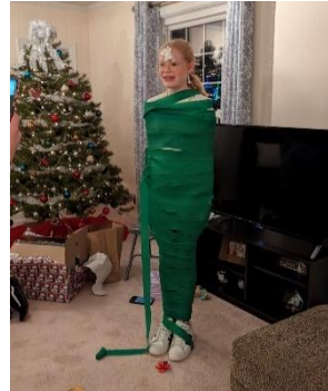
Our Youth Group has been "tied up"!